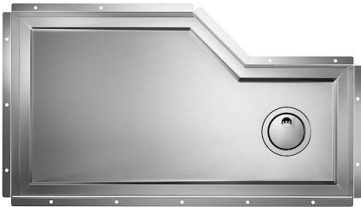
Sink Diade 3028 555